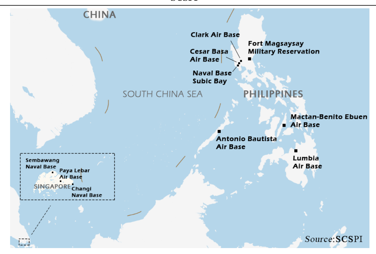
Chart 3. Distribution of US Military Bases in Singapore and the Philippines

The US has made some progress on the cooperation with the Philippines in recent years. In particular, the US and the Philippines reached an agreement in 2016, allowing the US troops to utilize five Philippine military bases, which stands to reason that it may reverse the inadequate military presence of the US on the forefront of the South China Sea. <sup>8</sup>When the US withdrew from military bases in the Philippines in the end of 1992, it could not find any sound reason to deploy military forces to the former colony anymore, until the signing of the "Visiting Forces Agreement (VFA)" in 1998 and the "Enhanced Defense Cooperation Agreement (EDCA)" in 2014. As put in the agreement, the US Navy could dock at the Subic Bay as visiting forces; the two countries began to conduct joint military exercises; the rotational deployment of US military forces in the country is allowed. In particular, the "Enhanced Defense Cooperation Agreement," which is effective for ten years, allows the US to access five military bases in the Philippines, namely the Antonio Bautista Air Base in Palawan, Basa Air Base in Pampanga, north of Manila, Fort Magsaysay in Palayan in the center of