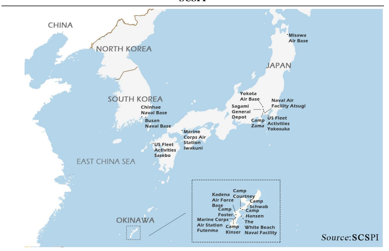
Chart 2. Distribution of the US Military Bases in Japan

As Guam is far away from the South China Sea, US warships and aircrafts are usually deployed from its military bases in Japan to the water. Japan is a hardline ally of the US in the Indo-Pacific region, which is evidenced by the US military bases located across Japan. According to the Base Structure Report – Fiscal Year 2018 Baseline , the US has 121 military sites in Japan, second only to Germany in terms of size. Among them, 87 are military bases and 34 are categorized as other sites. <sup>5</sup>These military bases are used either solely by US troops or jointly by US troops and the Japan Self-Defense Force.